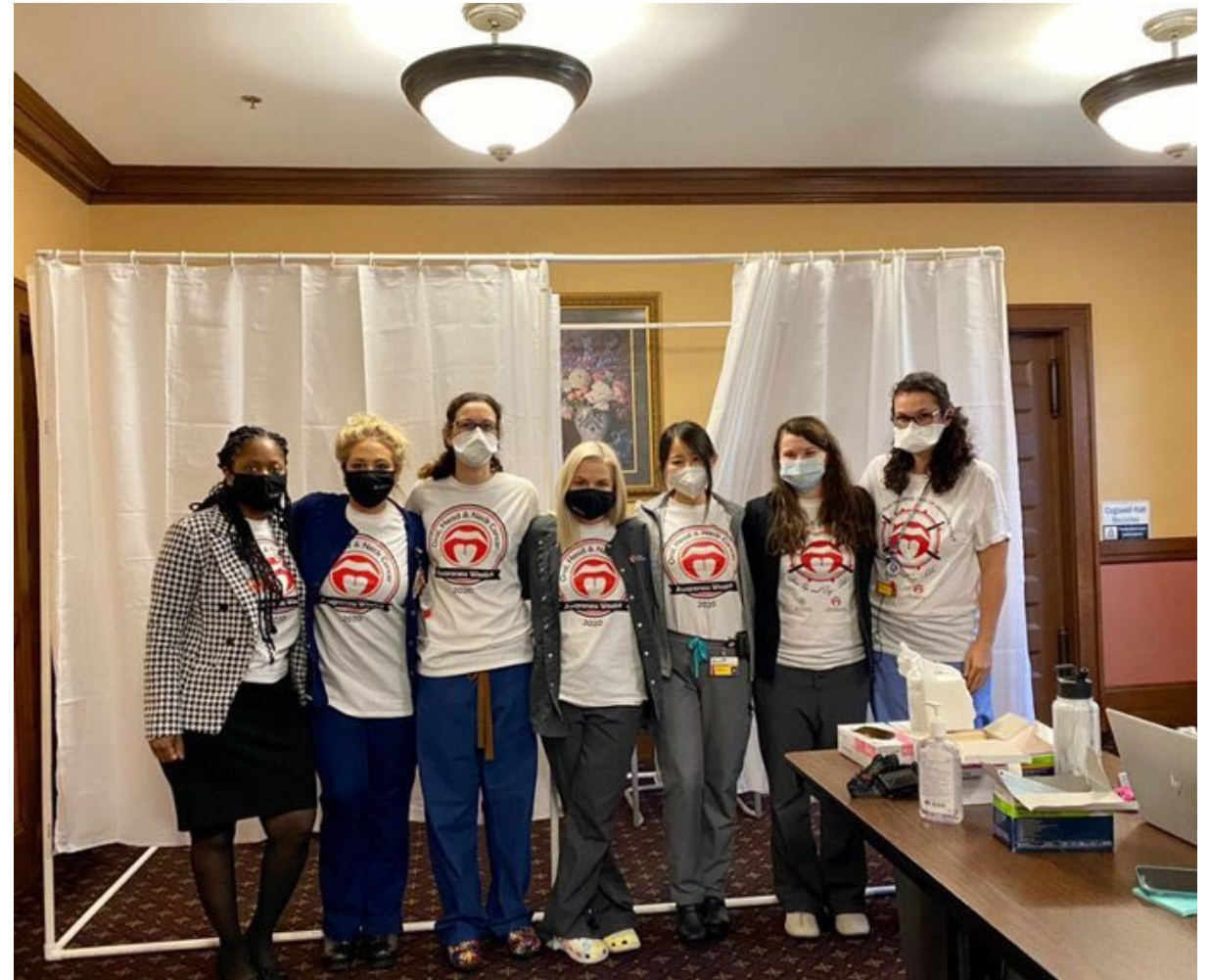
University Hospitals Cleveland ENT, 2020

HNCA Patient Gas Card Program: HNCA offers a limited supply of gas cards, in the amount of $50, to head and neck cancer patients to help with transportation to and from treatments.